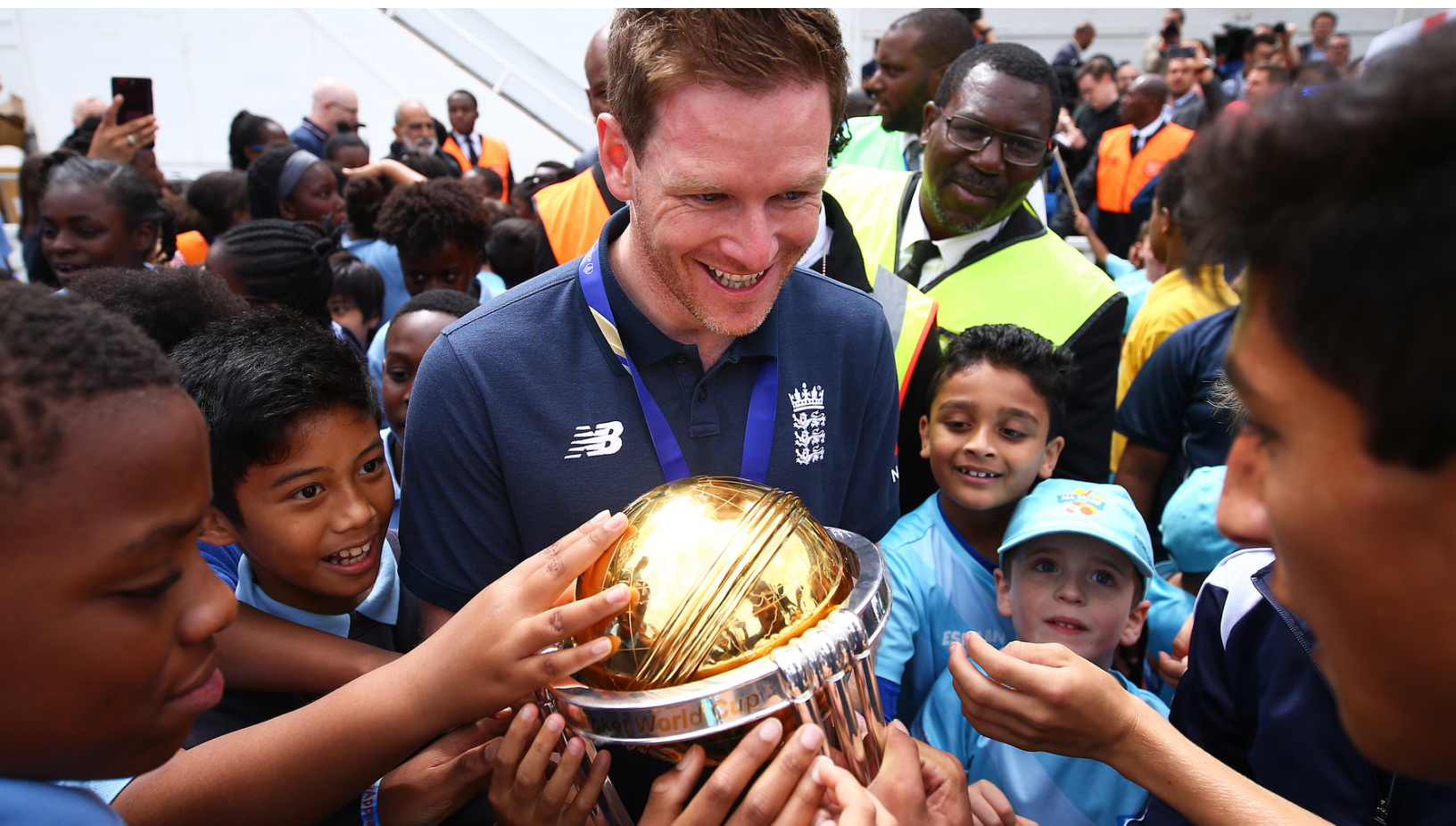
England ODI Captain Eoin Morgan celebrates ICC Men's World Cup win with kids from the All Stars Cricket programme