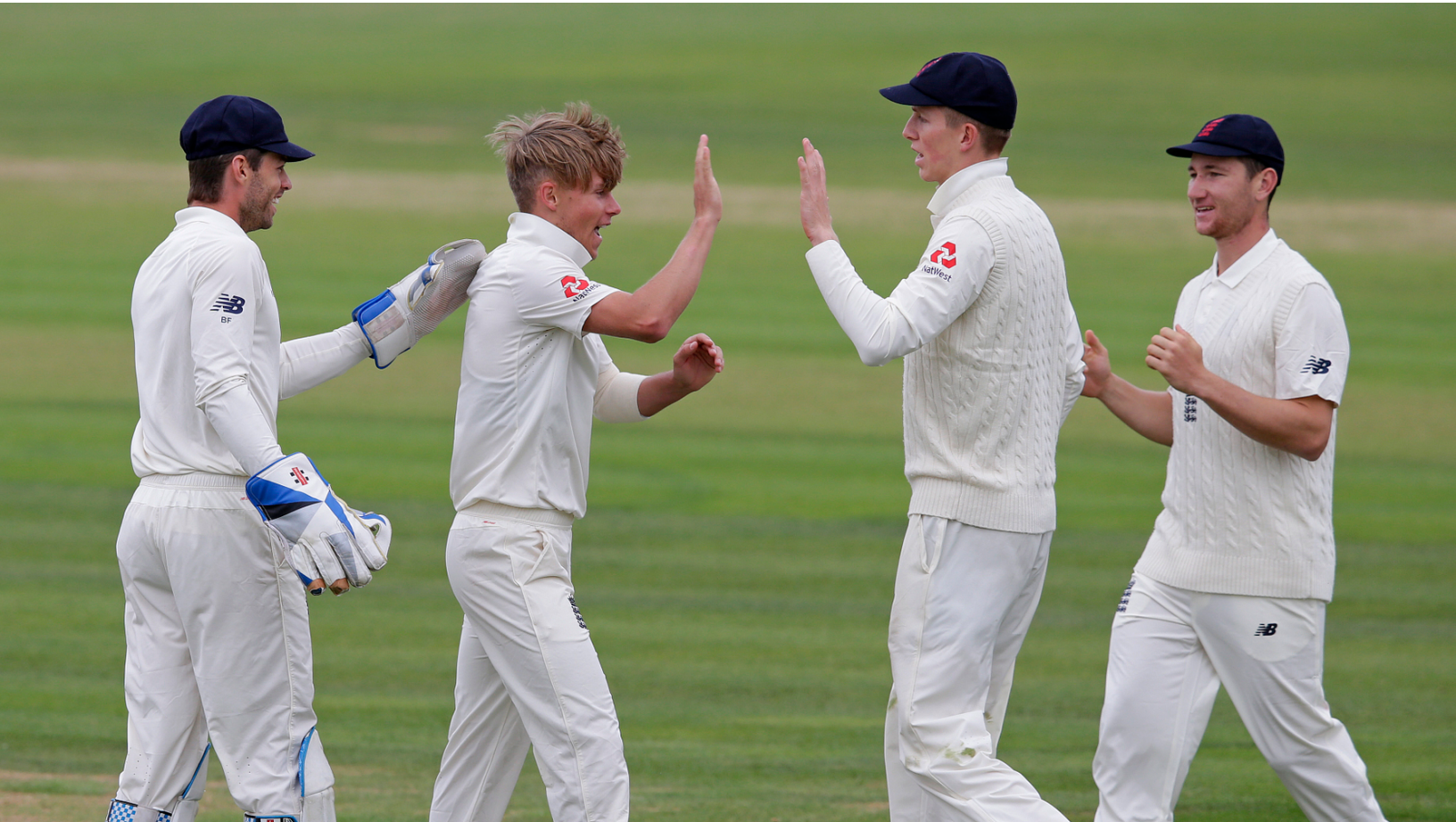
Sam Curran celebrates a wicket on day two of the England Lions game against Australia XI