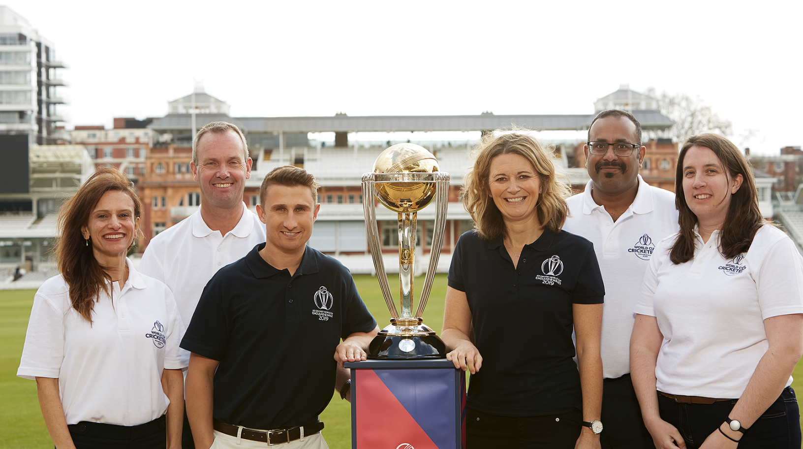
World Cup Cricketeer ambassadors Charlotte Edwards CBE and James Taylor with the ICC Cricket World Cup trophy at Lord's