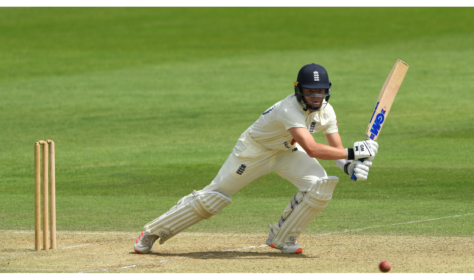
England's Ollie Pope in action at the Ageas Bowl