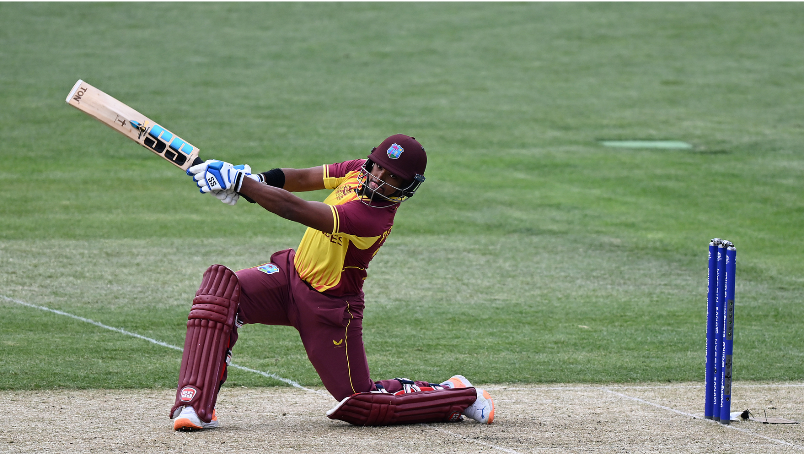
Nicholas Pooran will be at Headingley in 2024.