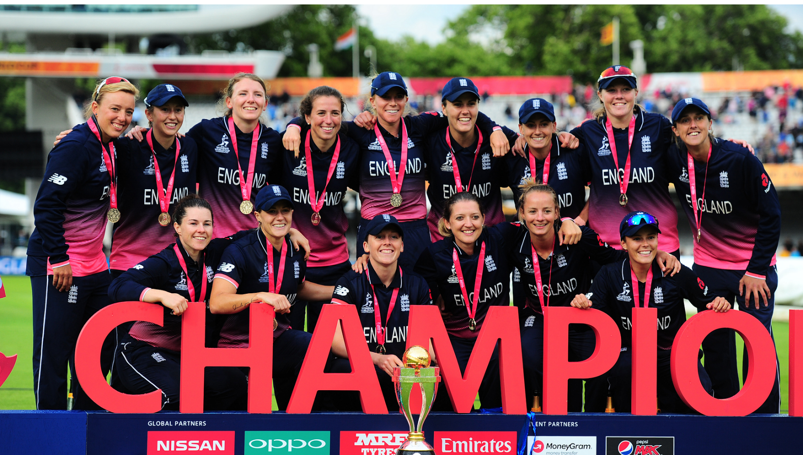
The England women's team with the ICC Women's World Cup in July.