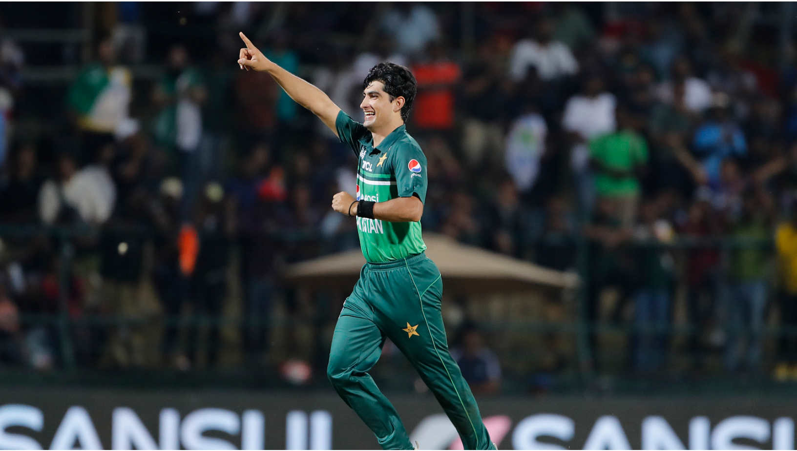
Naseem Shah will be at Edgbaston in 2024.