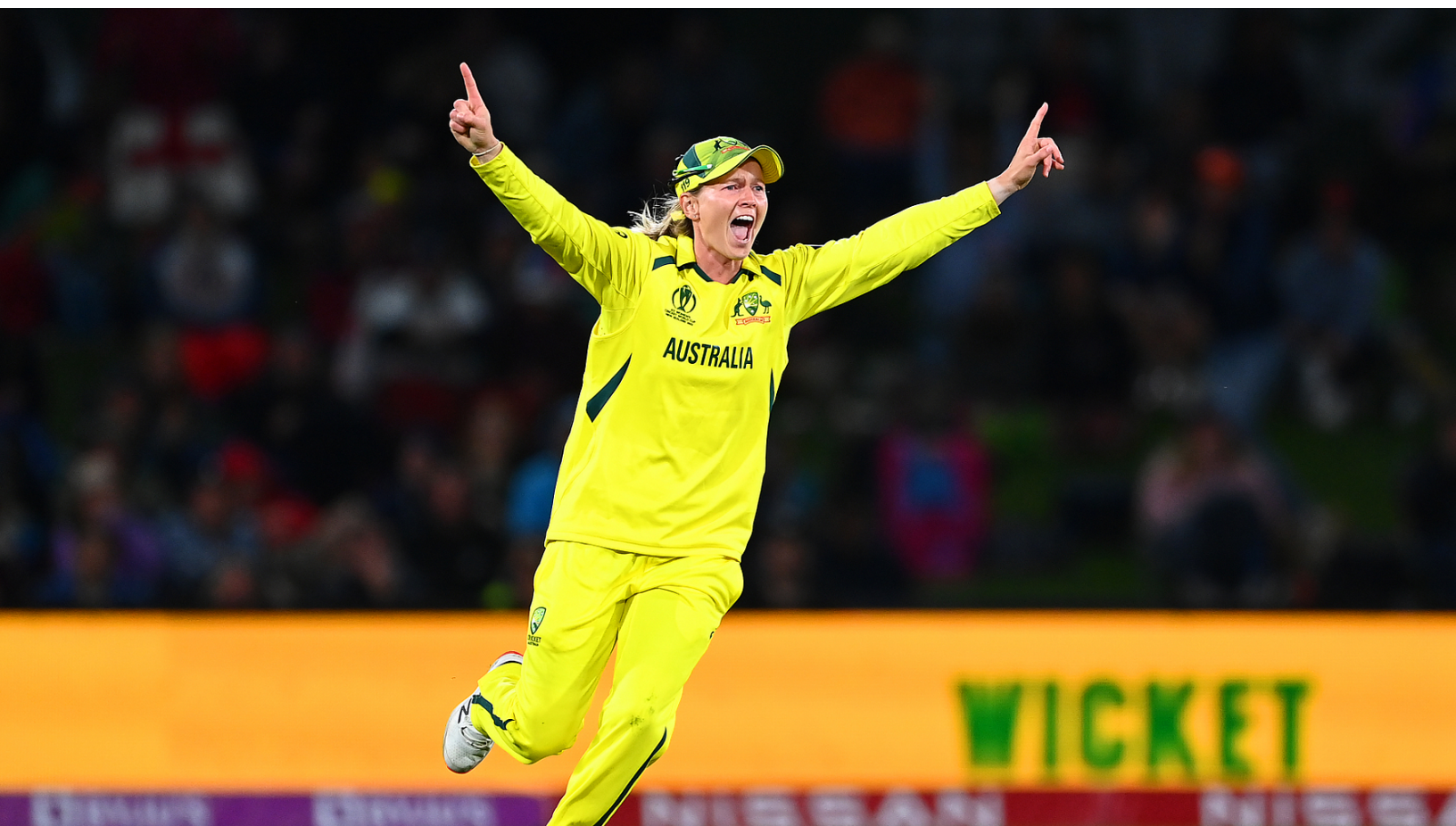
Meg Lanning will be at Lord's in 2024.