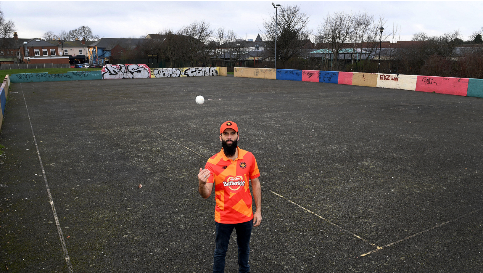
Moeen Ali, Stoney Lane Park, Birmingham