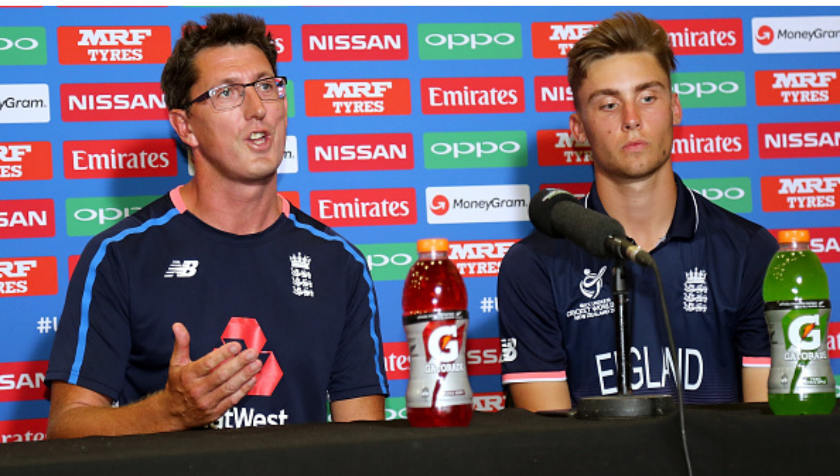
Jon Lewis faces the media with Will Jacks during the ICC Under-19 World Cup in New Zealand