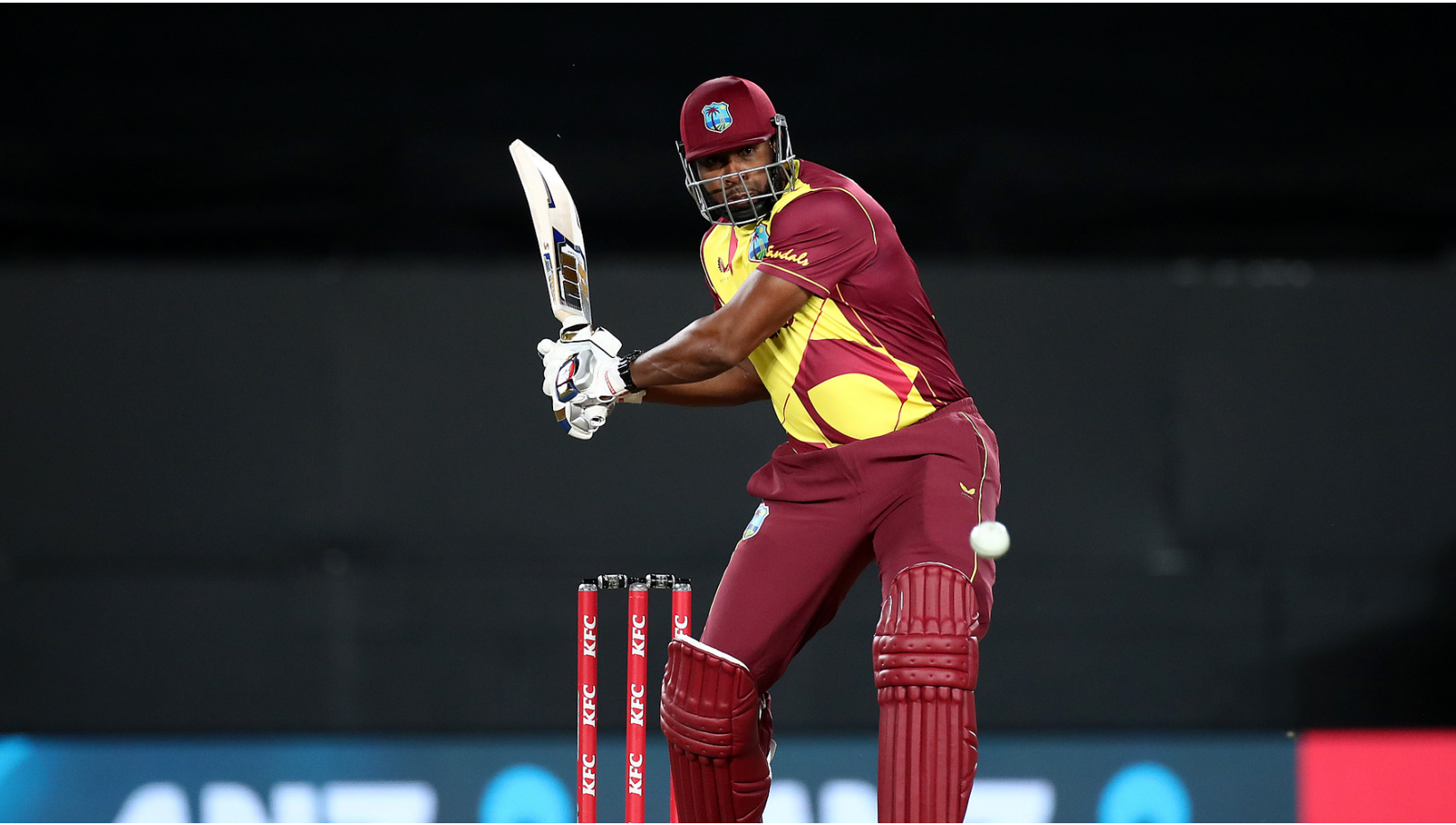
Kieron Pollard will be at Utilita Bowl in 2024.