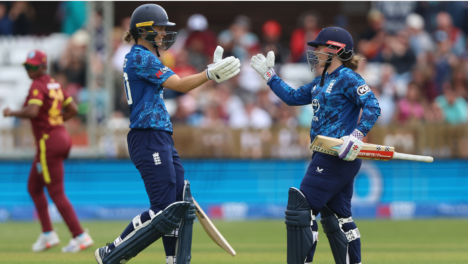
England Women's Amy Jones and Tammy Beaumont.