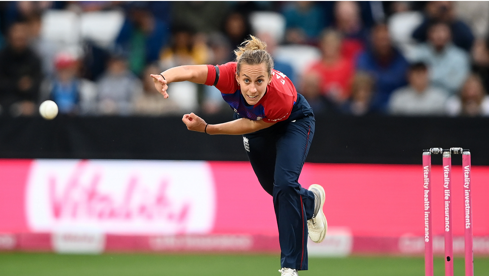
Tash Farrant in action for England.