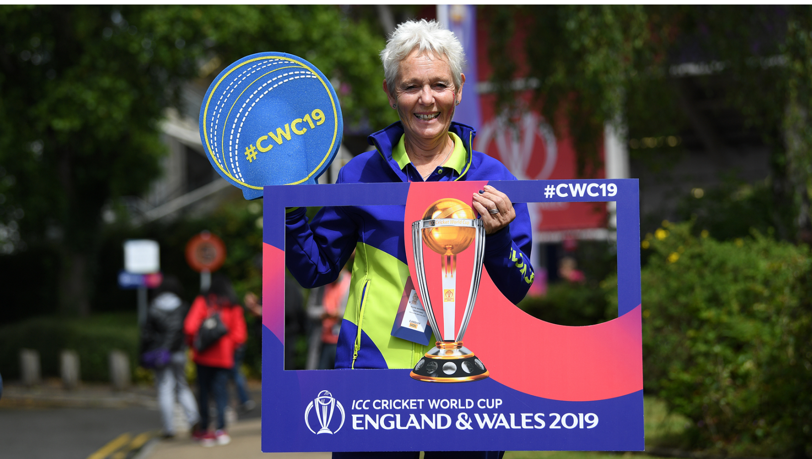
A volunteer helps out at the ICC Men's Cricket World Cup 2019