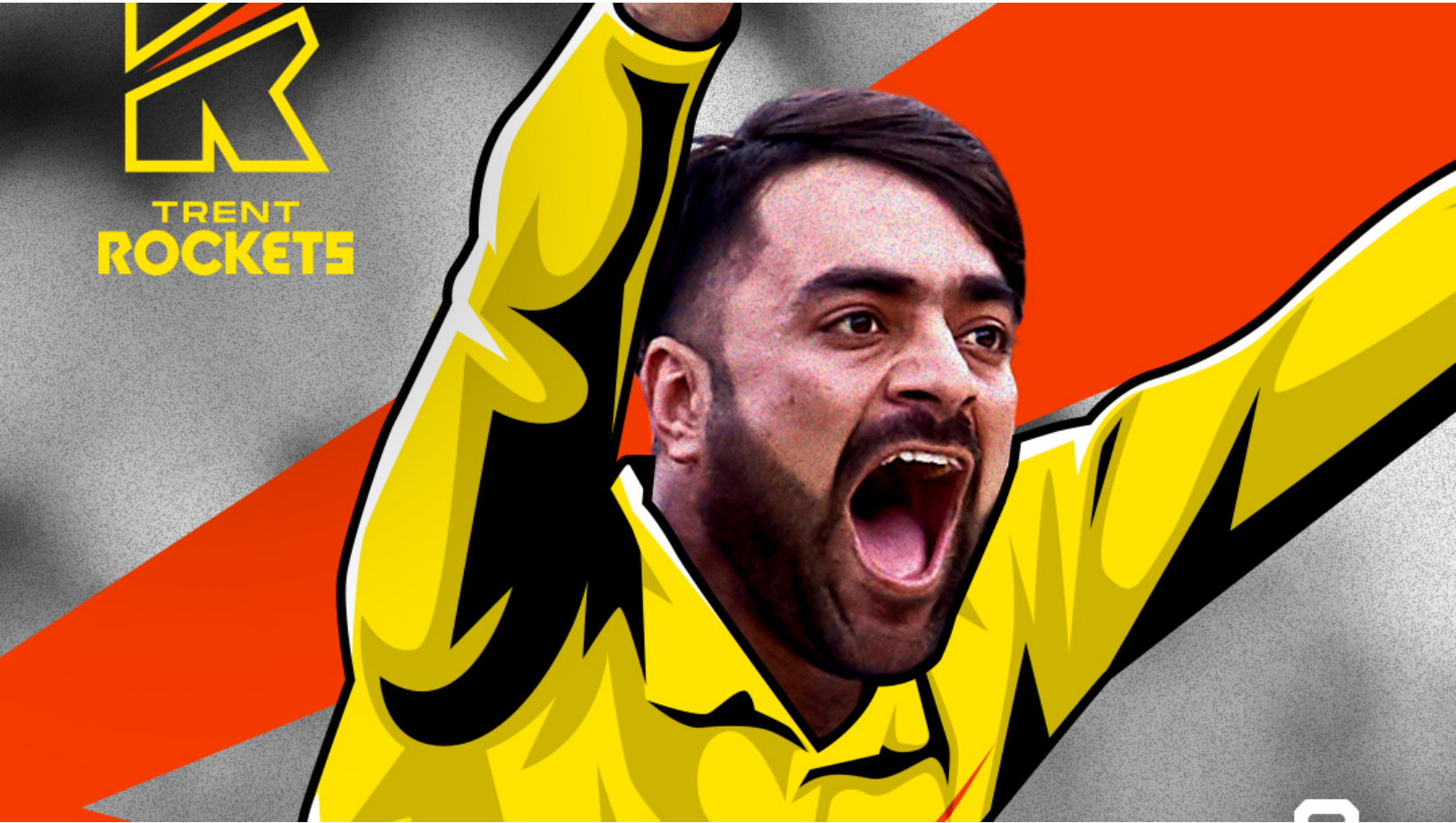
Rashid Khan was selected first by Trent Rockets