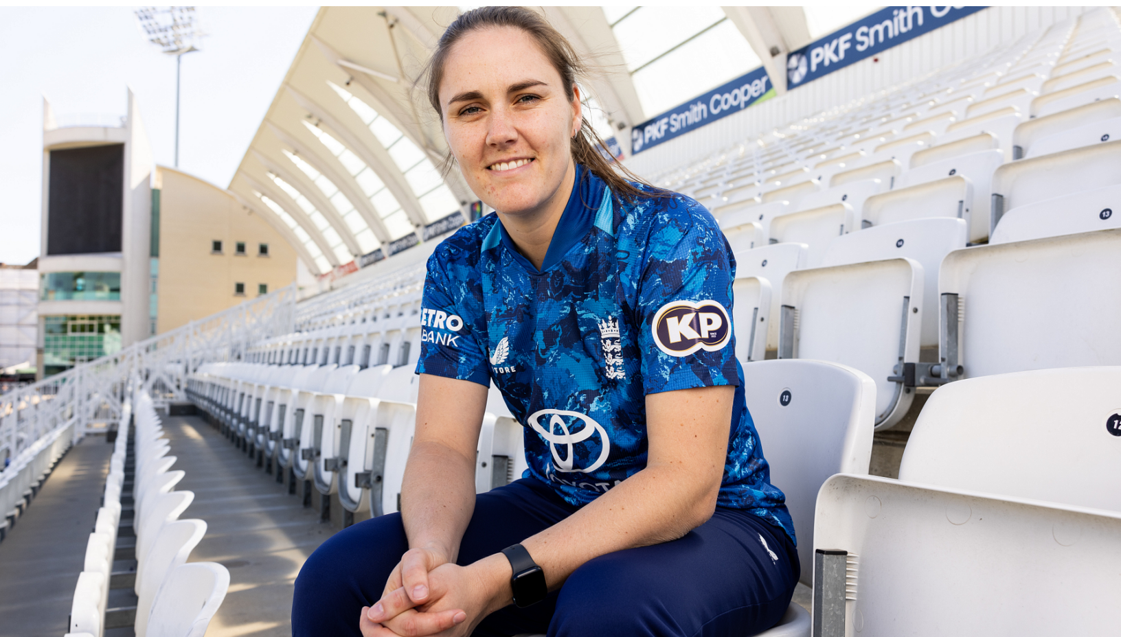
Captain Nat Sciver-Brunt will lead England during the series