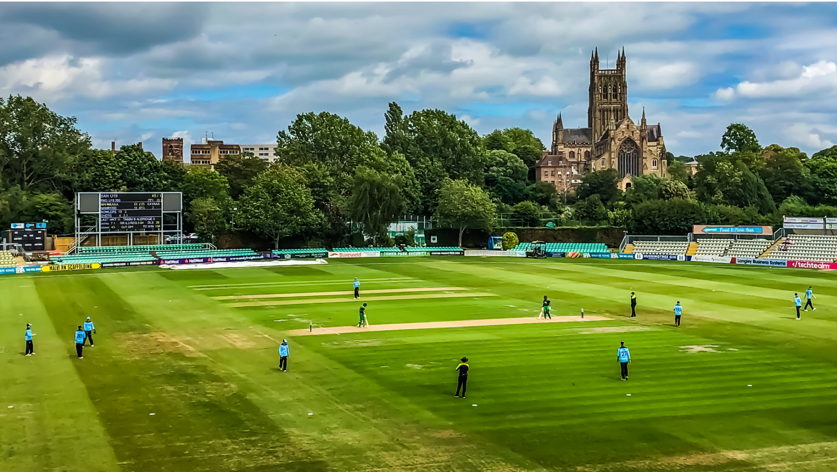
England U19 v Bangladesh U19 at Blackfinch New Road