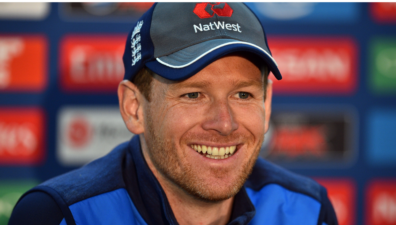
England white ball captain Eoin Morgan