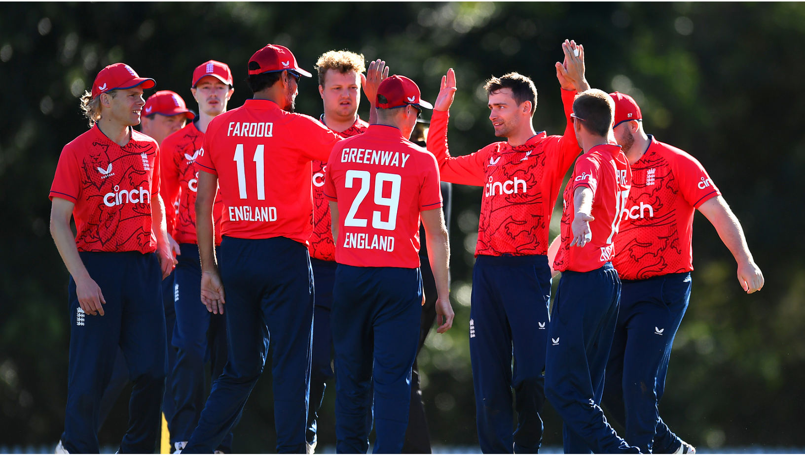
England Men's Deaf team celebrate a wicket in 2022.