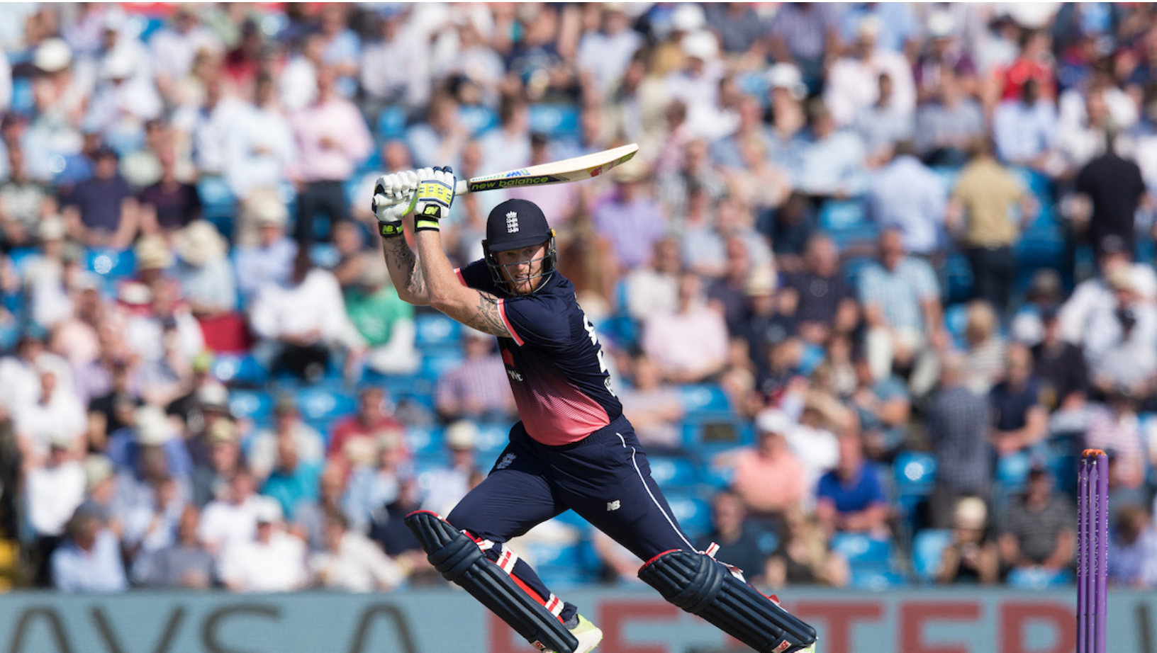
Ben Stokes in action for England