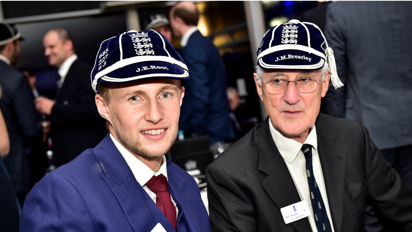
Joe Root and Mike Brearley at the England players dinner last year