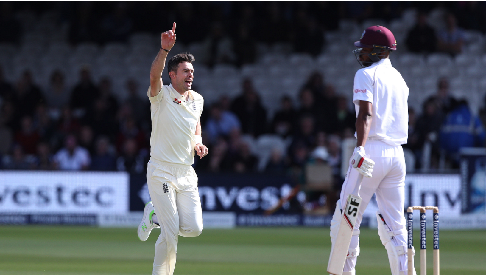
England's Jimmy Anderson celebrates a dismissal during last summer's Test series against the West Indies