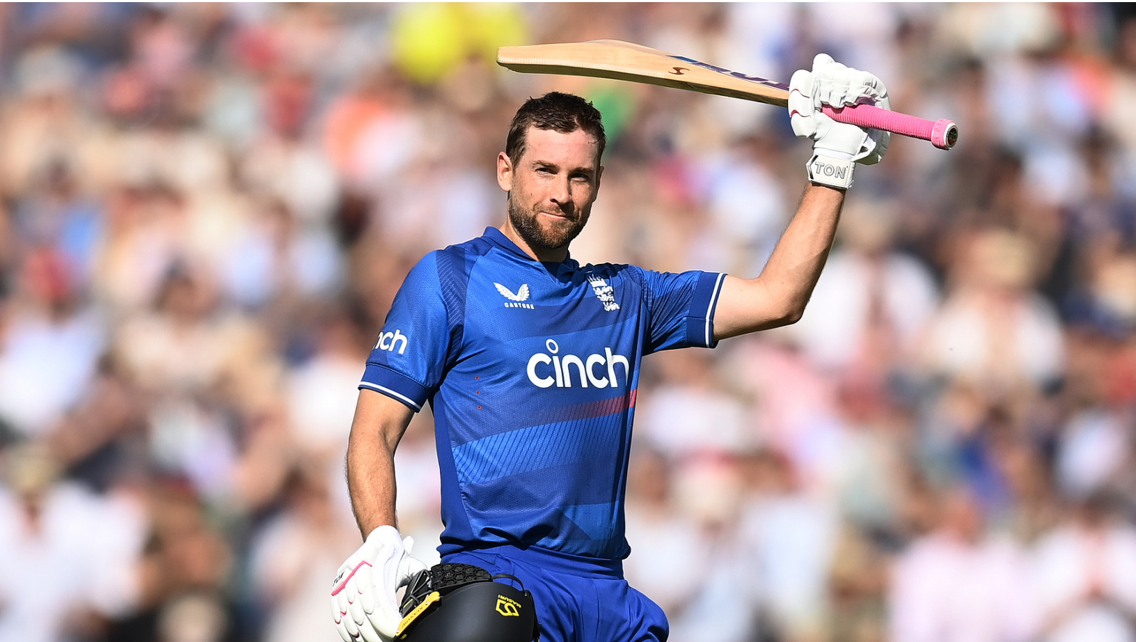
Dawid Malan will be at The Kia Oval in 2024.