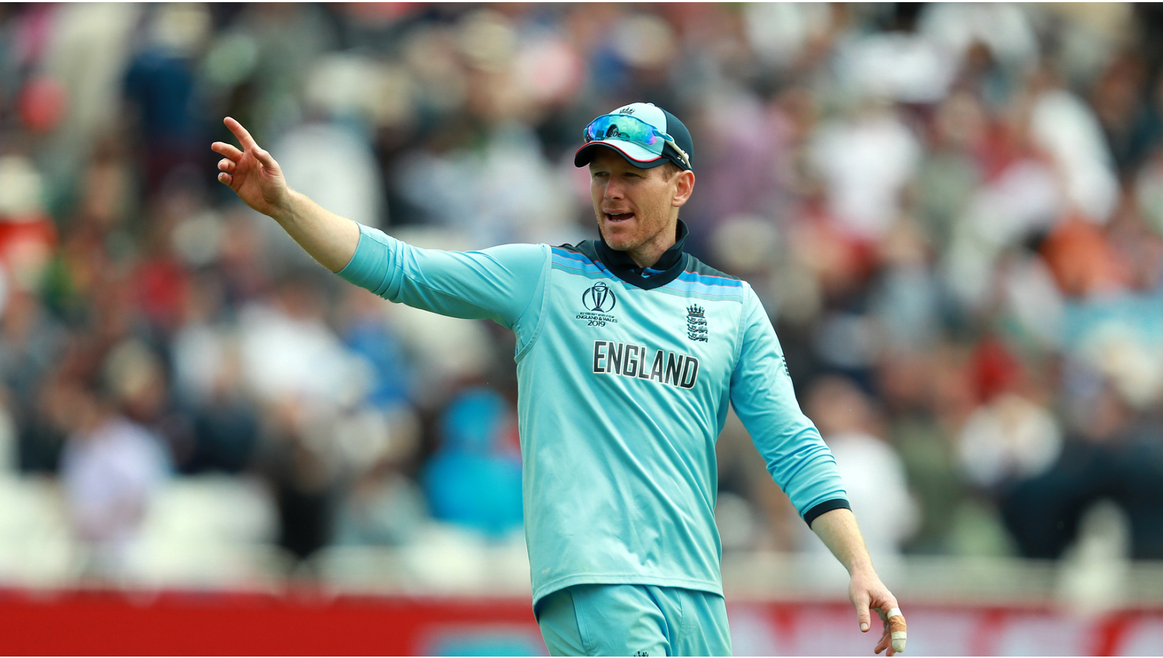
England Men's ODI Captain Eoin Morgan