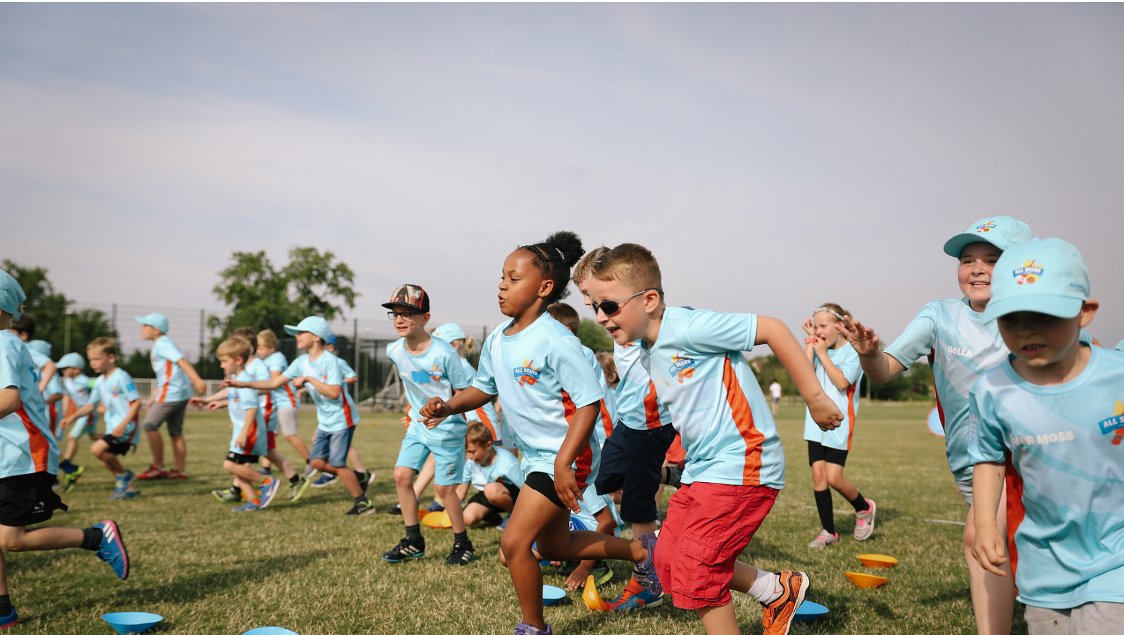
Children take part in All Stars Cricket at Hardwicke Cricket Club