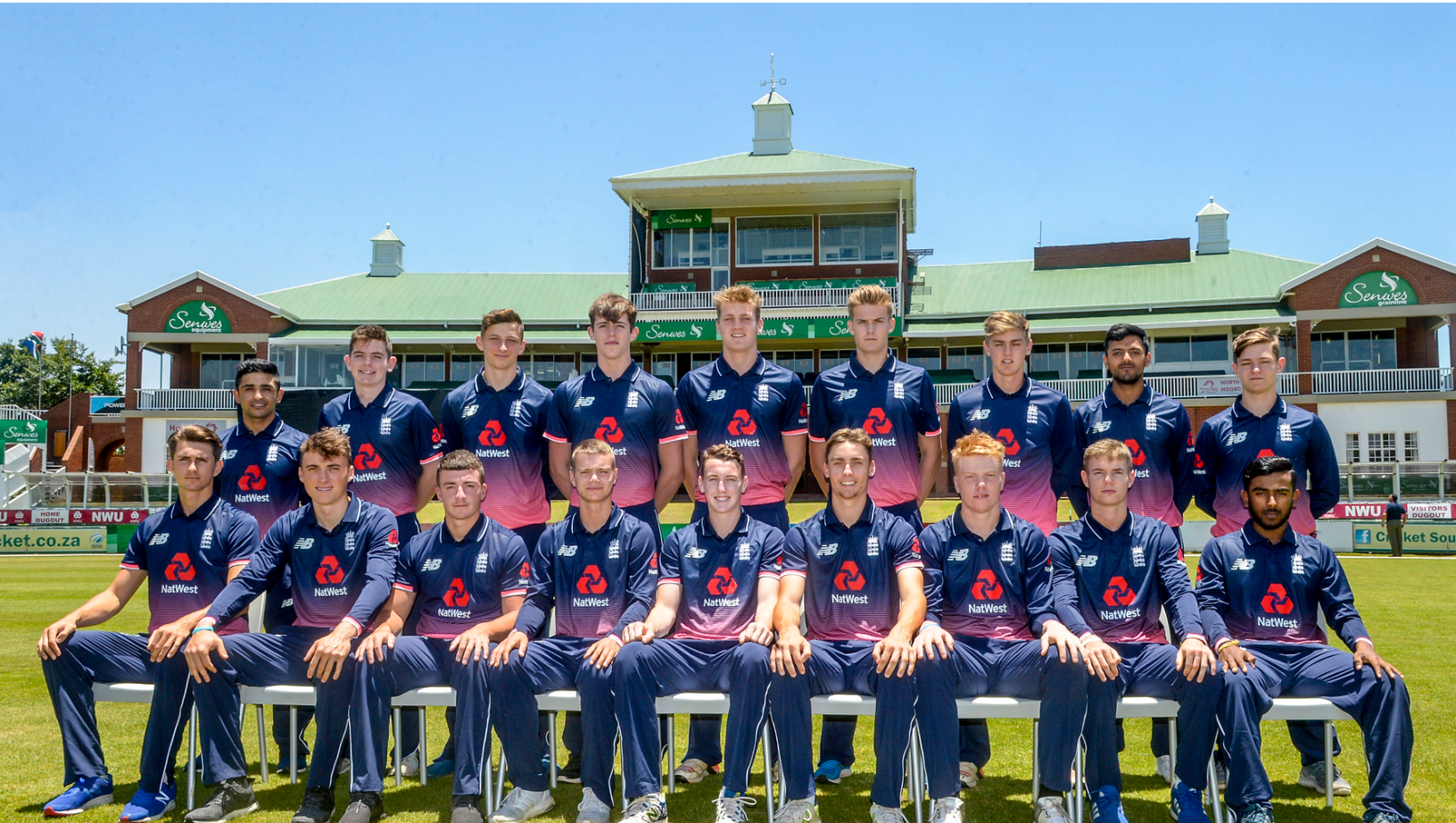
England's Under-19s squad in Potchefstroom during their Tri-Series against South Africa and Namibia