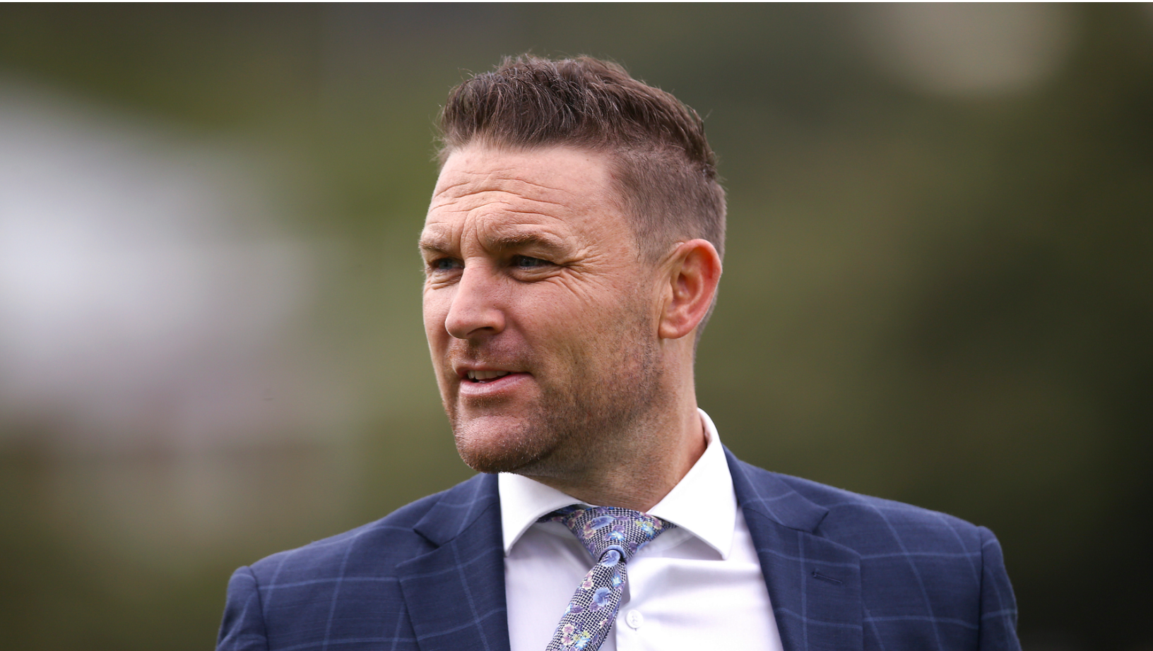
England Men's Test Head Coach, Brendon McCullum