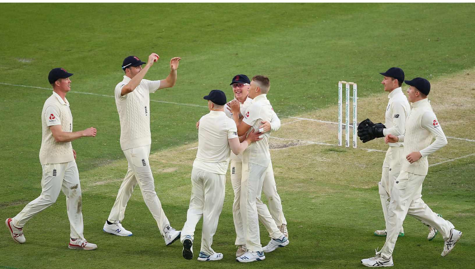
Brydon Carse celebrates a wicket for England Lions against Australia A