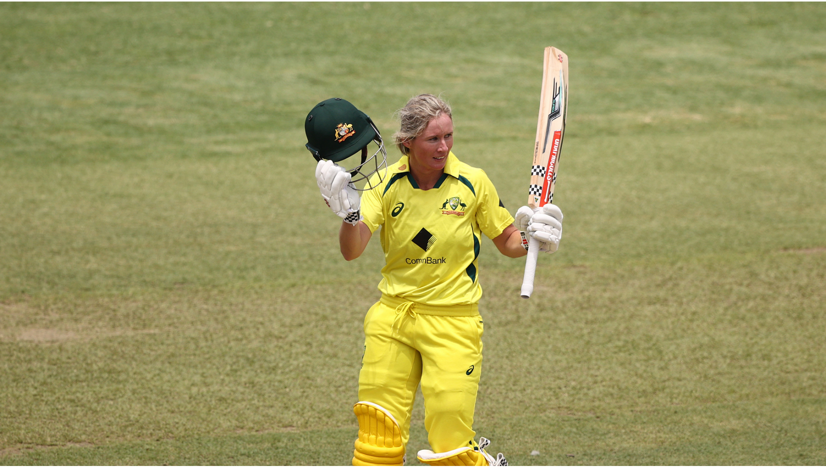
Beth Mooney will be at Emirates Old Trafford in 2024.