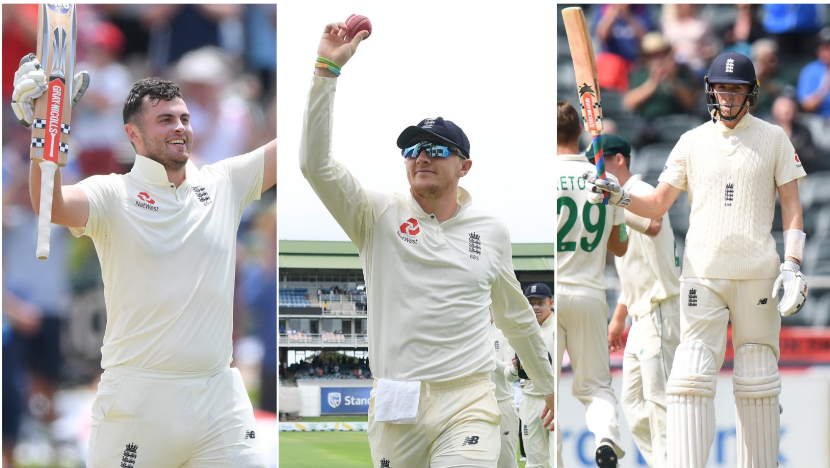
Dom Sibley, Dom Bess and Zak Crawley have all starred in England's Test tour of South Africa