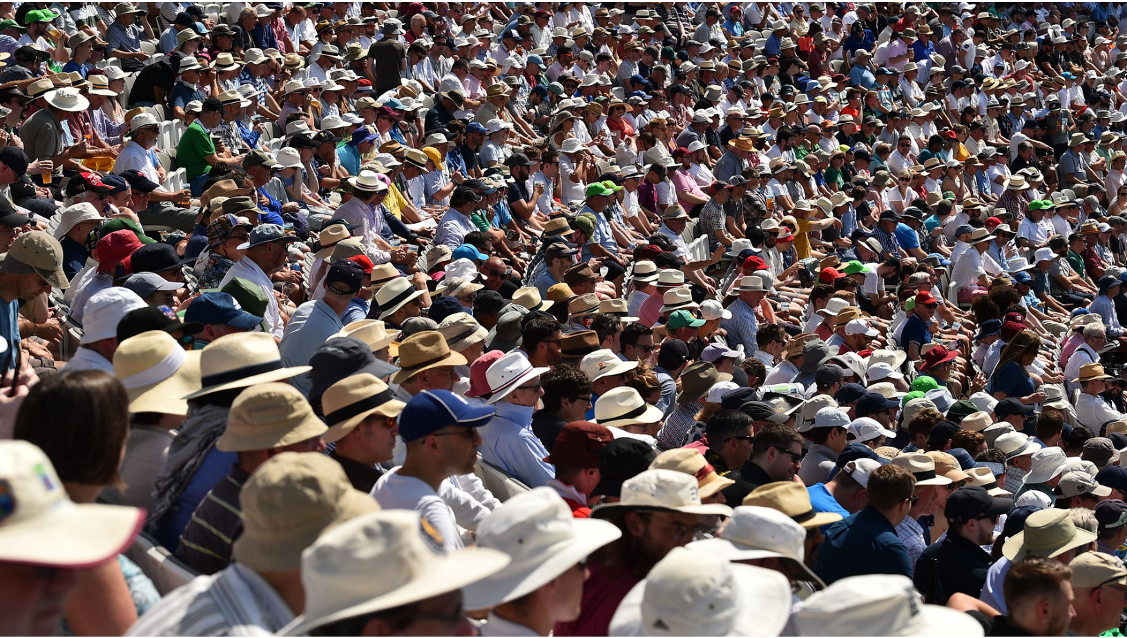
Spectators watch the first Test between England and Ireland at Lord's