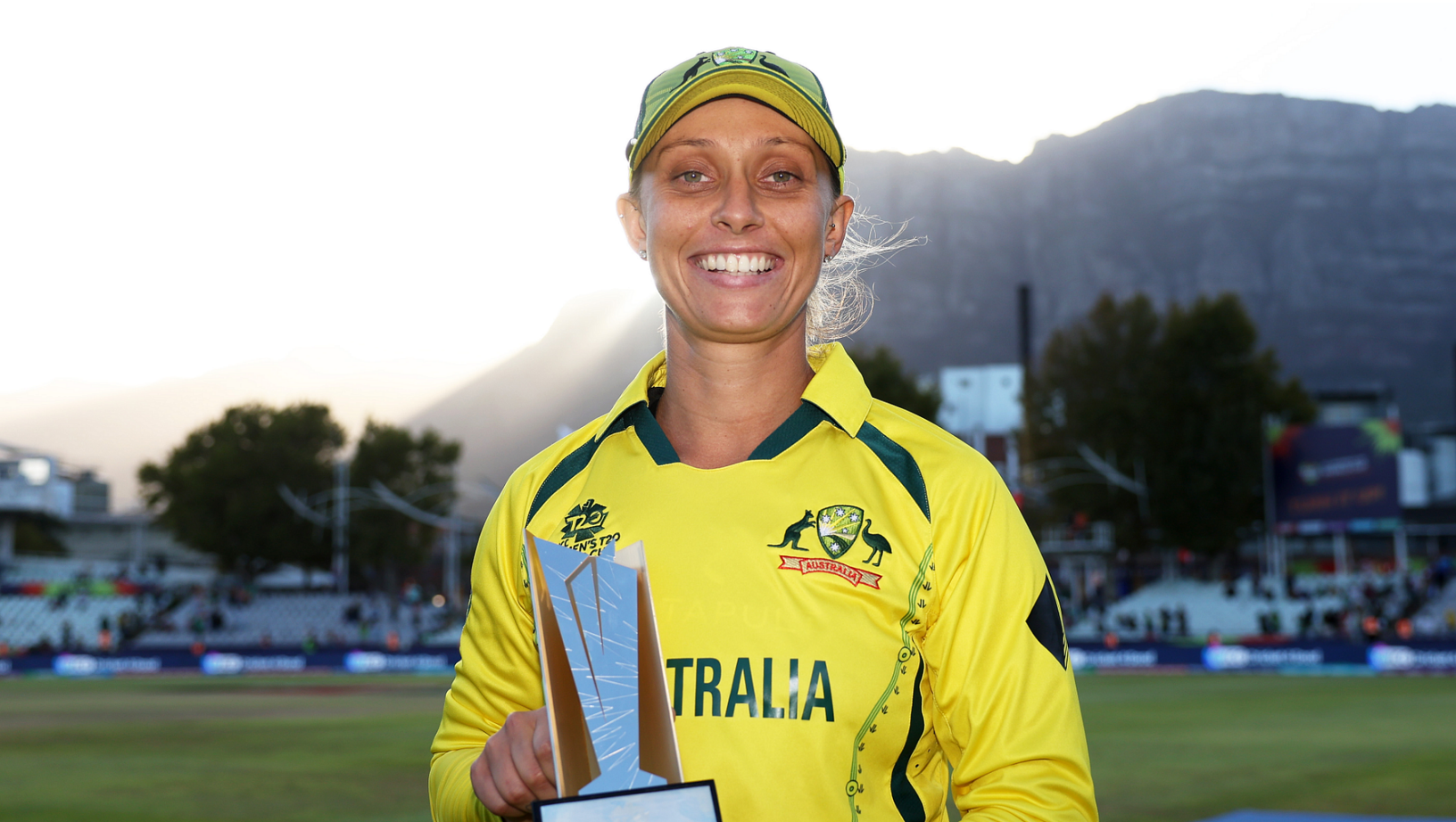
Ash Gardner will be at Trent Rockets in 2024.