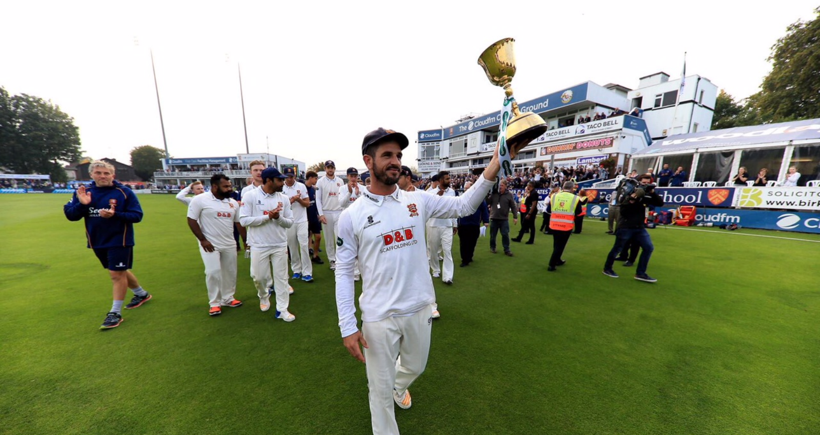
Ryan ten Doeschate with the County Championship trophy in September 2017