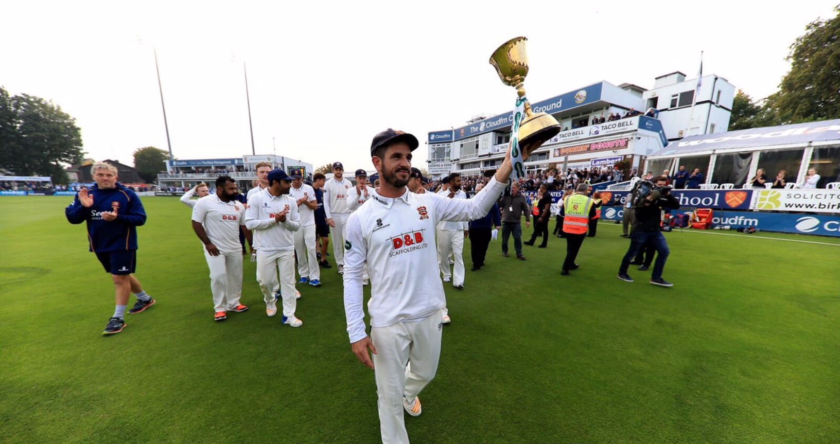
Ryan ten Doeschate with the County Championship trophy in September 2017